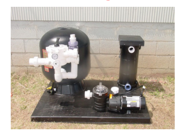
Step 5: Attach Multiport valve to front of filter. (See Filter manual for more details)