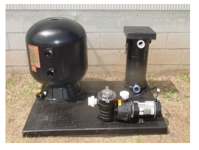
Step 4: Set water pump to the front right side of the pad.

It is now time to start assembling the plumbing. Connect "like number to like number" as shown in the picture. <u>Hand</u> tighten unions until snug.