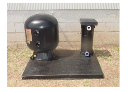
Step 3: Set your Zapp Pure UV to the back right of the pad. (Zapp Pure UV not shown in Picture)