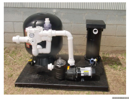
Step 6: Attach pipe from pump to top opening of Multiport valve.