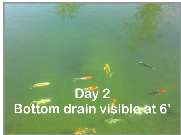
Day 2 Bottom drain visible at 6'